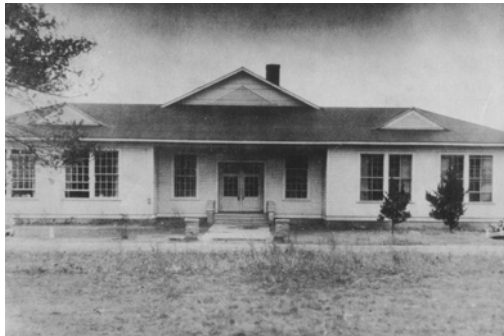
Ninth Avenue School 1939 - 1950