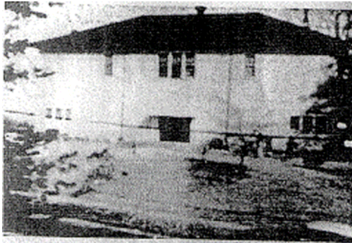
Sixth Avenue School 1916 - 1951